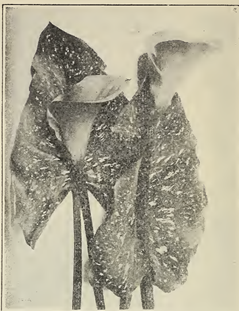
Calla Elliotiana—Yellow Calla

This is the finest Calla grown; large deep, rich golden yellow color. The leaves are spotted with white, habit like our old favorite White Calla. Ready for shipment January 1st.